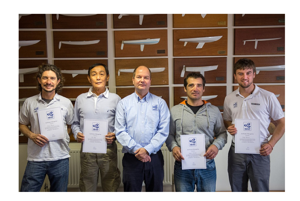
2014 ISAF Development Symposium